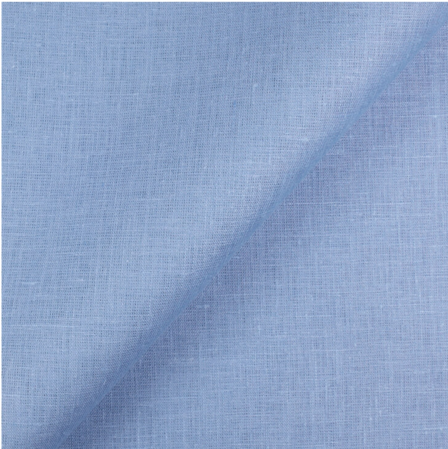
FS ALLURE Midweight Linen

Cezanne was born in Provence in 1839, but he spent much of his early adult career living in and around Paris. There he mingled with the Impressionist