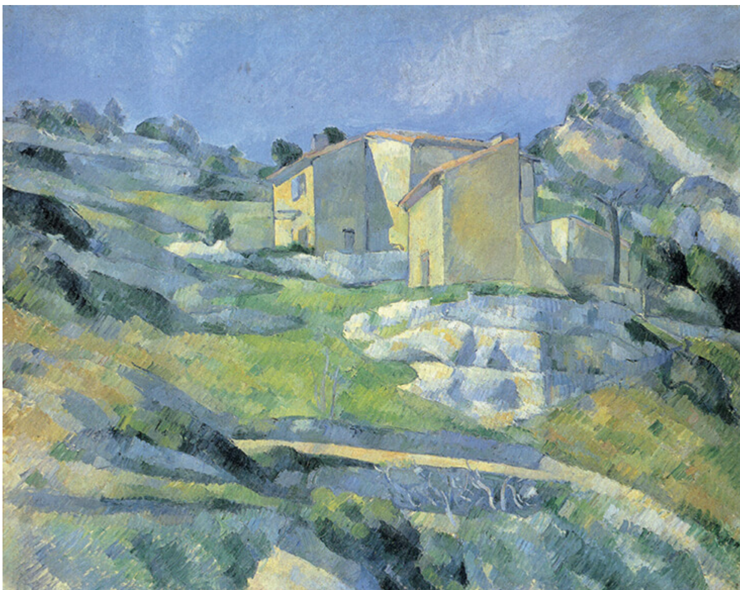
Houses at L'Estaque, 1880

painters and took part in several of their ground-breaking displays that broke with tradition, moving away from the stuffy traditionalism of the Parisian Salon towards a new world of avant-garde modernism. Much like the Impressionists, Cezanne enjoyed painting en-plein-air, but in contrast with the feathery lightness of fellow Impressionists including Claude Monet and Camille Pissarro, Cezanne's works from this period already had a heavier, sturdier and more sculptural quality that was moving towards Post-impressionism.