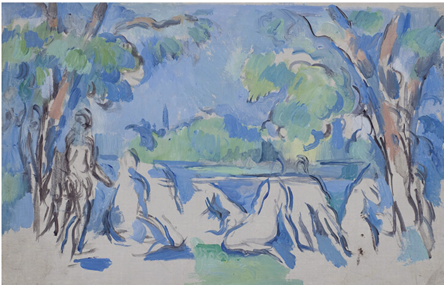
Study for Bathers, 1902-6